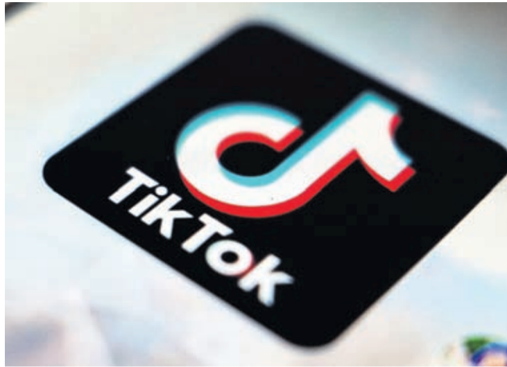
The TikTok app logo appears in Tokyo on Sept. 28, 2020.

The amount of misinformation and the ease with which it can be found is especially troubling given TikTok's popularity with young people, according to Steven Brill, founder of News-